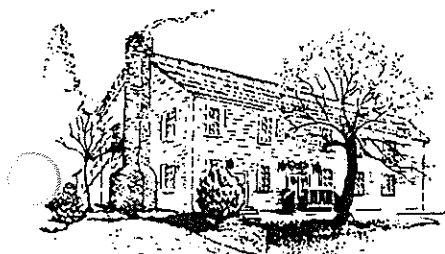
Old Aurora Colony Ox Barn, Aurora, Oregon